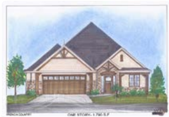
The rendering above represents one of six model styles that have been proposed as part of the Cottages at Village Green Heights.

On Monday, March 27, the Pleasant Prairie Plan Commission considered and approved a Conceptual Plan for the development of 72 condominium units on vacant property north of Main Street at 47 th Avenue. Doug Stanich is proposing to construct 38 single-unit condominiums and 17 two-unit condominiums. The development has been named the Cottages at Village Green Heights.